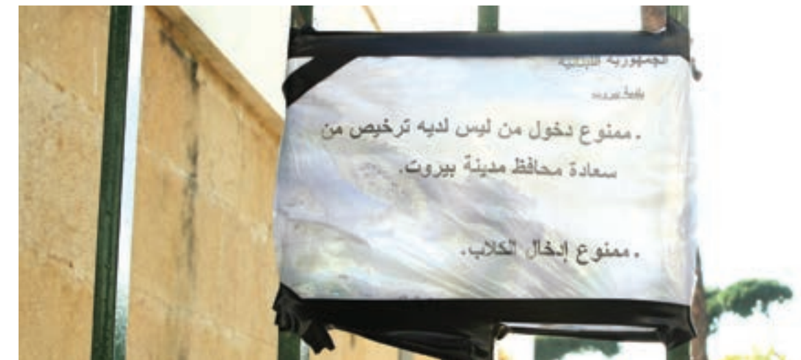
Sign placed by the Beirut municipality saying that persons cannot enter if they do not have a permit.

To achieve these objectives, specialized teams of volunteers dedicated themselves to a distinct set of tasks: A research committee developed arguments for the reopening of the park taking into consideration legal, social, psychological and environmental aspects. In the meantime, the activities committee planned and coordinated advocacy activities, while the communication committee laid particular focus on outreach through social media.