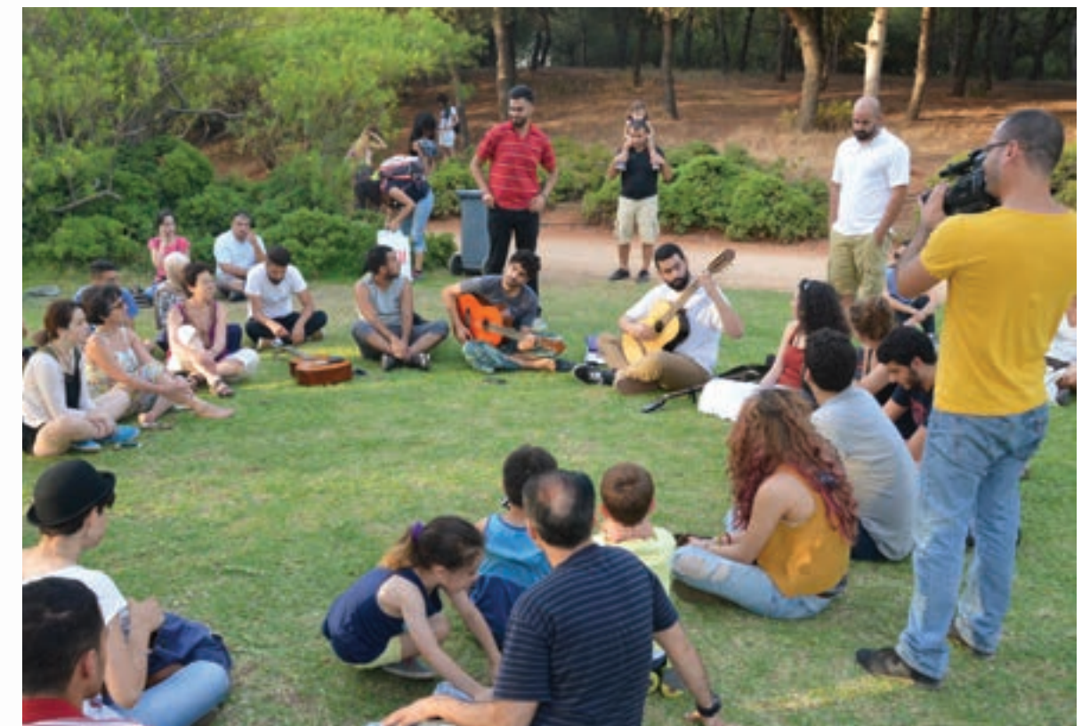
Horsh Beirut as it should be.

So the first step of the campaign was to devise strong valid arguments for the reopening of the park.