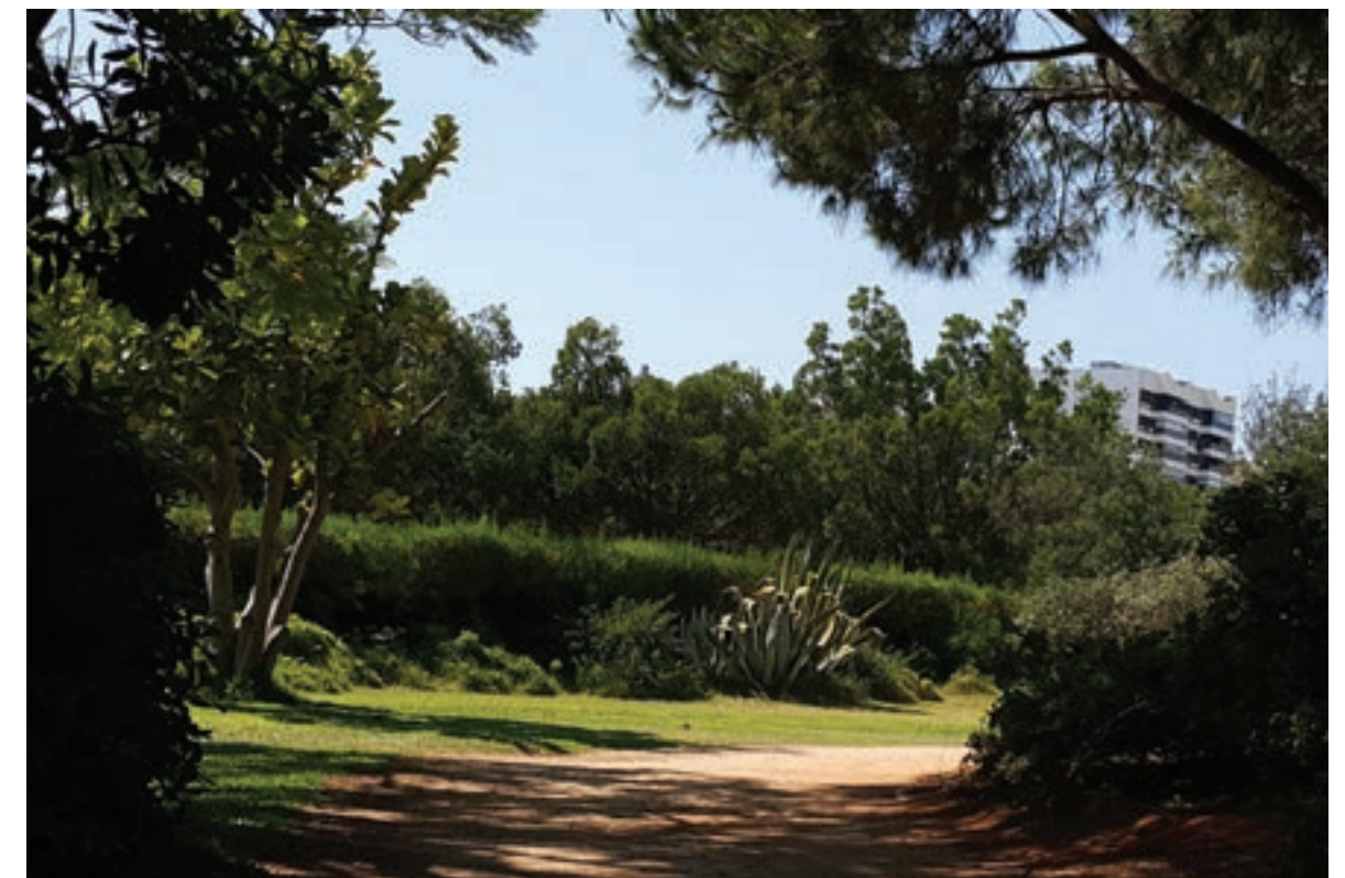
A general view of Horsh Beirut.

This brochure tells the story of our journey.