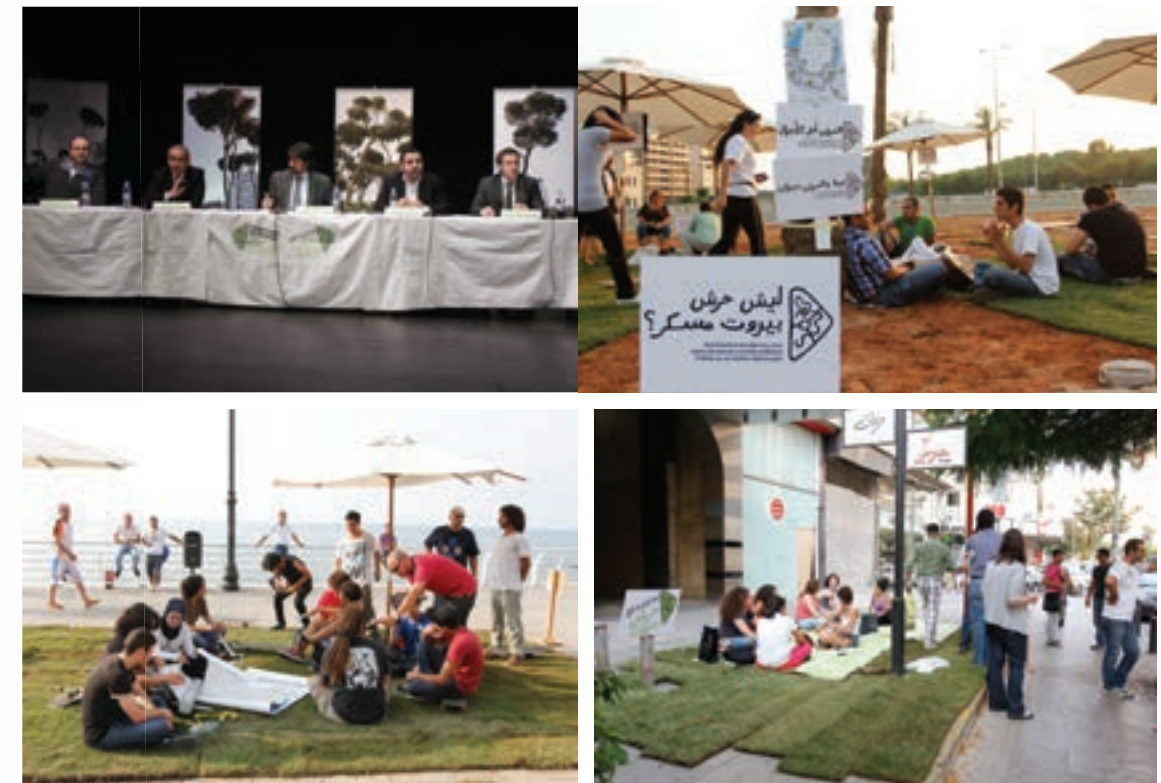
Various protests around town and a Town Hall meeting with the head of the Beirut municipality.

was uncooperative and was not responsive to the campaign's solicitations, the team adopted a more confrontational strategy, relying on public and media mobilization through public activities and debates. Through this approach, the cause of Horsh Beirut grew to be a public cause and the municipality therefore had to publicly voice a clear stance on the matter and later issue an official decision to outsource the management of the park to ensure it is reopened to the public. However, the date of the reopening was continually pushed back. Sustained public pressure, the threat to file a lawsuit, and the appointment of a new governor who was willing to cooperate with the campaign finally led to the successful reopening of the park.